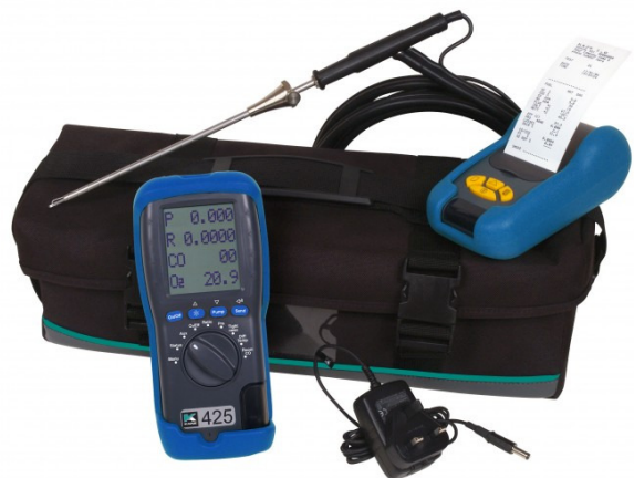
The Kane 425 boiler gas analyser kit, typical of the instrumentation being tagged as part of the Kane project.