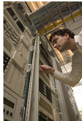
RFID in the data centre speeds the checking of servers and storage devices.

Attaching RFID tags to data centre assets means they can be easily located and checked. The value of RFID in the data centre is already acknowledged by vendors such as IBM and HP, who now offer their systems with tags already attached. CoreRFID's IT Tracker system is a complete solution to the problems of recording and keeping track of RFID tagged IT assets. CoreRFID provide scanners, tags, readers and a proven software system that can be readily integrated with existing asset registration systems.