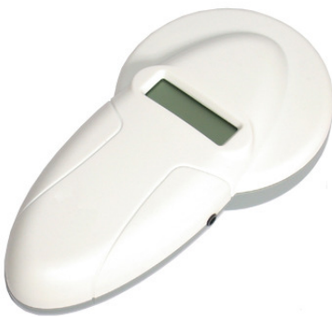
Figure 4 : This stand-alone reader can collect data from up to 1000 tags, display the tag data values and upload the information in its memory via a Bluetooth link.

Readers can be found to suit a wide range of applications