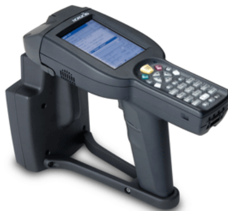
Figure 5 : This Nordic PL3000 Cross Dipole UHF handheld computer is available with an RFID tag reader built in to enable data collection applications where the user needs computing capability for other aspects of their work.

Reader writers are also available embedded within general purpose portable computing devices such as HP iPAC Pocket PC, Nordic PL3000 or the PSION Workabout Pro. These hand-held devices are usually selected on the basis of the work needed to be carried out by the user or depending on the nature of the environment in which the work is being carried out. The tag reader adds as little as 30g to the weight of the hand-held device, making it easy to use without affecting other tasks.