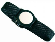
Figure 2 : Wristband mounted RFID tags can be used in access control applications.

Different types of tags have different data capacities. Typically tags have 224 bits to circa 1k bits of user memory for LF tags, or 2k bits for HF tags. The relatively low capacity of data that can be held on tags means that applications need to be carefully designed and generally involve linking data held on the tag with data held on an external database.